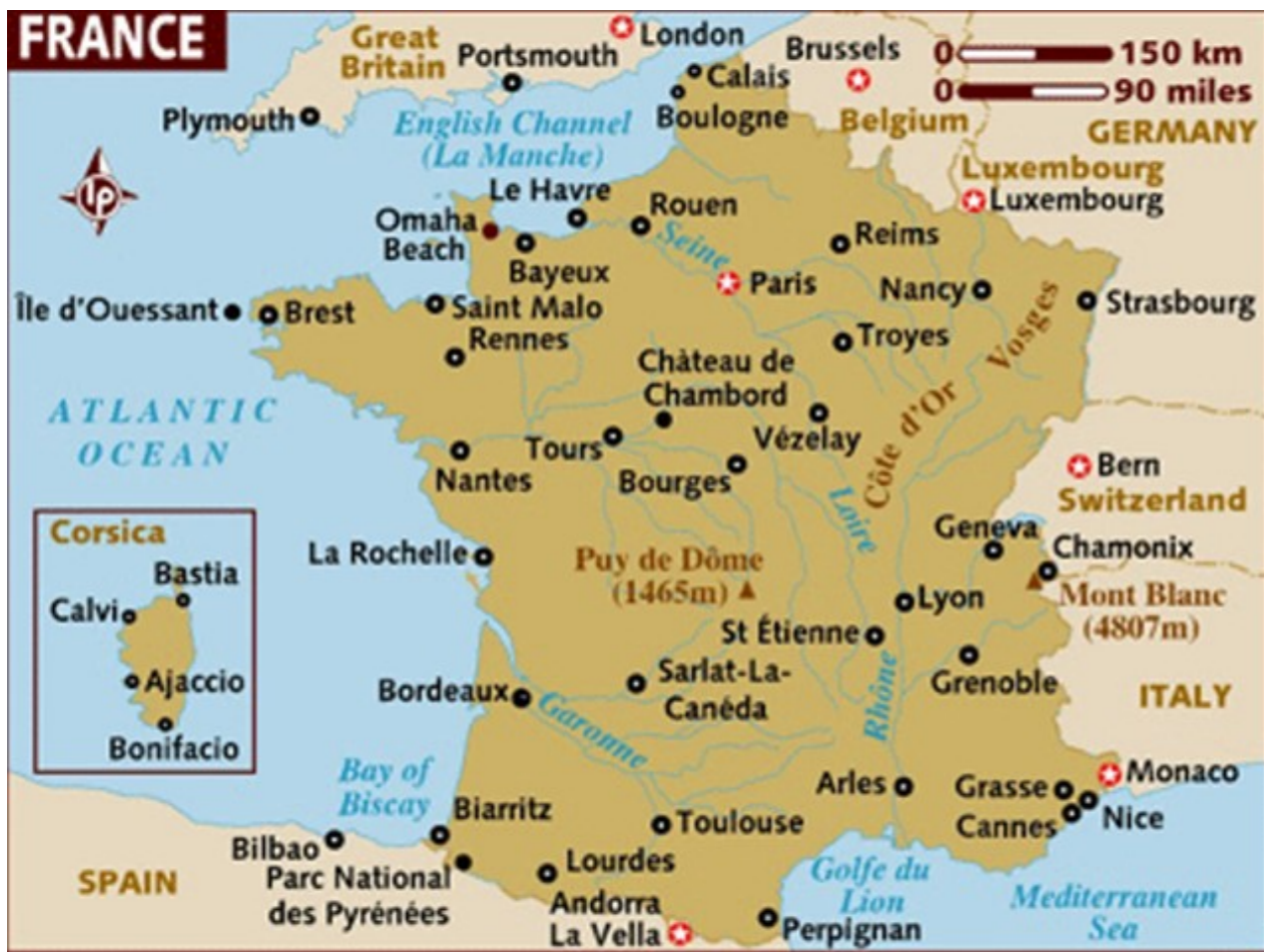
A map of France

There are many ways to travel between the UK and France. These include the Eurostar Train, flying, Eurotunnel, ferry (car, coach, bike, bicycle, walk).