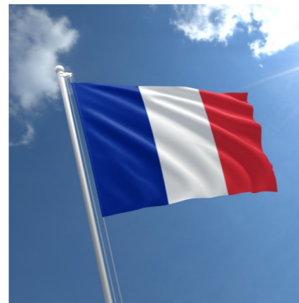
The French flag is called the tricolore.